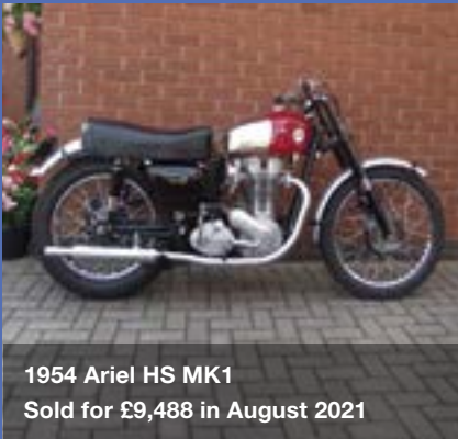
1954 Ariel HS MK1 Sold for £9,488 in August 2021