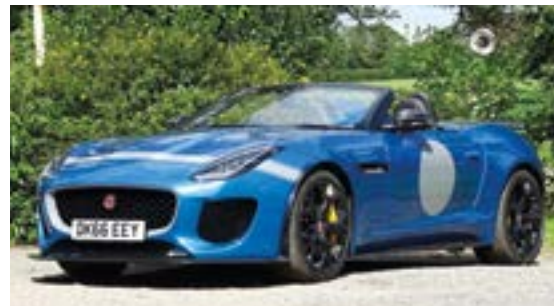
2016 Jaguar F-TYPE Project 7 Sold for £99,000 in October 2020