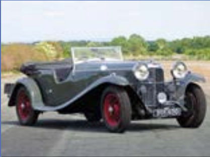
1934 Lagonda M45 T7 Tourer Sold for £184,500 in June 2020