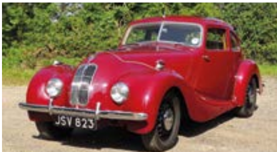
1948 Bristol 400 Sold for £72,000 in October 2010