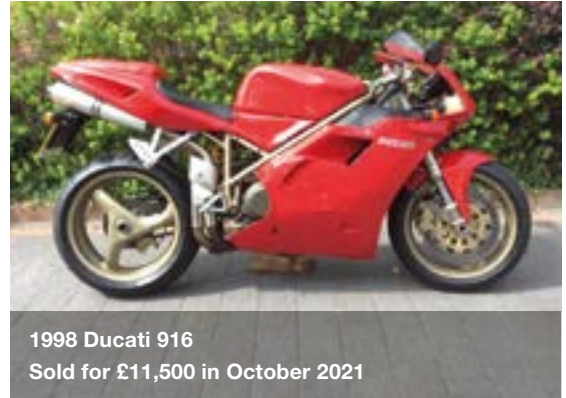
1998 Ducati 916 Sold for £11,500 in October 2021