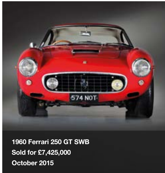
1960 Ferrari 250 GT SWB