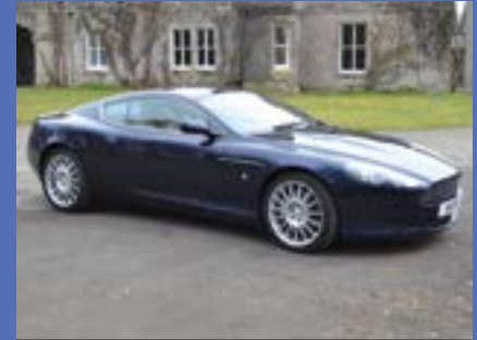
2007 Aston Martin DB9 Sold for £36,000 in May 2021