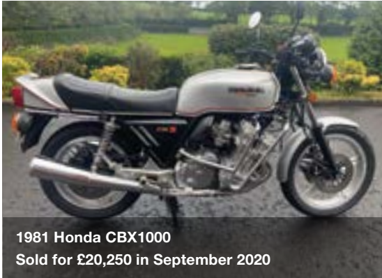
1981 Honda CBX1000 Sold for £20,250 in September 2020