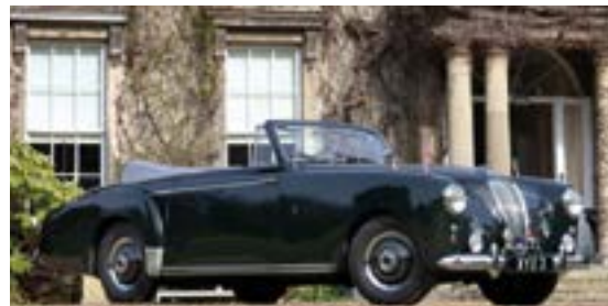
1954 Lagonda 3 Litre Drophead Coupe Sold for £337,500 in April 2016