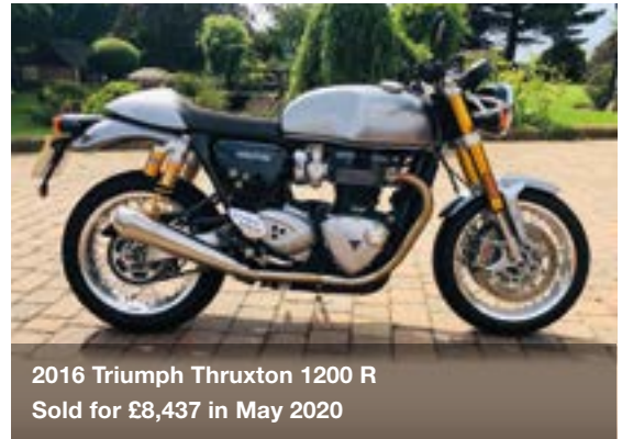
2016 Triumph Thruxton 1200 R Sold for £8,437 in May 2020