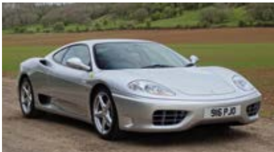
2000 Ferrari 360 Modena Sold for £61,875 in May 2021