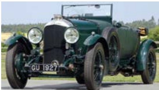
1929 Bentley 4.5 Litre 'Le Mans' Style Tourer Sold for £855,000 in October 2018