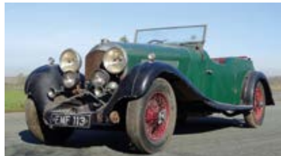
1936 Bentley 4.5 Litre Vanden Plas Tourer Sold for £444,375 in March 2019