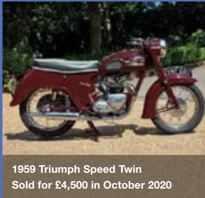
1959 Triumph Speed Twin Sold for £4,500 in October 2020