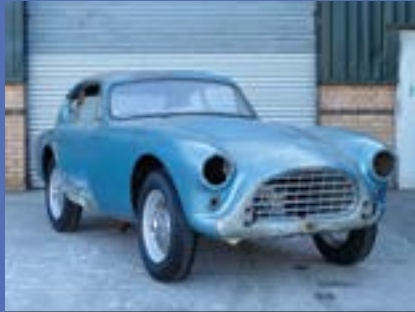
1960 AC Aceca Bristol Sold for £99,000 in March 2021