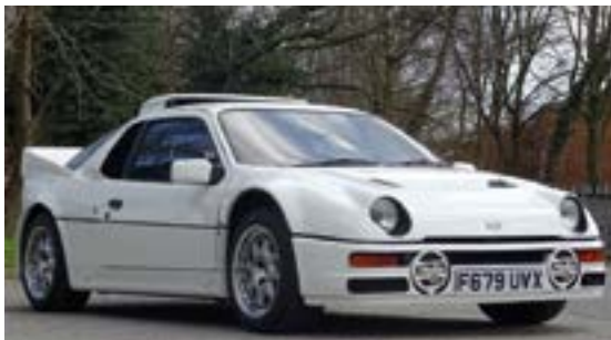
1986 Ford RS200 Sold for £148,500 in March 2018