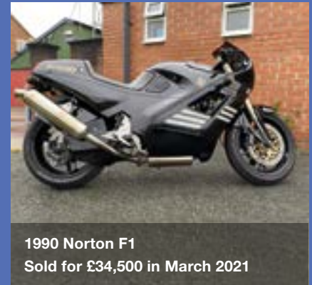
1990 Norton F1 Sold for £34,500 in March 2021