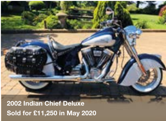
2002 Indian Chief Deluxe Sold for £11,250 in May 2020