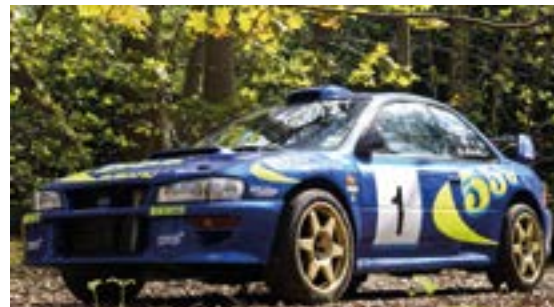
1996 Subaru Impreza WRC 97 Sold for £230,625 in June 2017