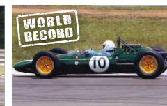
1962 LOTUS 25 F1 [MARCH, 2007]