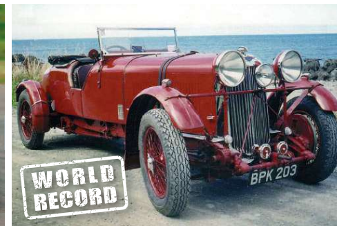
1934 LAGONDA M45 FOX & NICHOLL TEAM CAR [JULY, 2005] Raced by John Cobb and Dudley Benjafield at the Le Mans 24-hours and TT