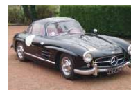
1955 MERCEDES-BENZ 300SL 'GULLWING' [APRIL, 2013]

H&H Classics become the fifth ever auction house to sell a motor car for more than $11,000,000