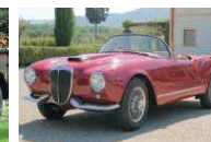
1955 LANCIA AURELIA B24 SPIDER AMERICA [OCTOBER, 2008]