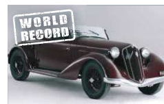
1935 ALFA ROMEO 6C 2300 PESCARA SPIDER [FEBRUARY, 2008]