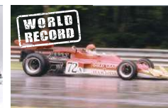
1970 LOTUS 72 F1 SINGLE SEATER [JULY, 2007]