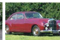
1956 BENTLEY S1 CONTINENTAL FASTBACK [OCTOBER, 2013]