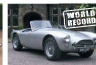
1961 AC ACE 2.6 [JULY, 2009]