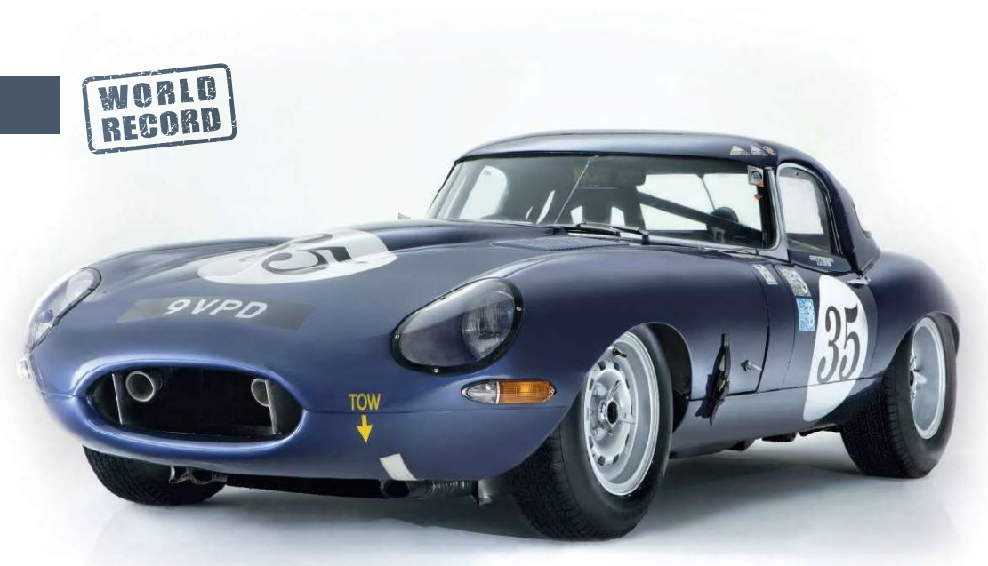
1961 Jaguar E-Type 3.8 Competition Roadster (chassis 0007) £858,000 [IWM Duxford, April 2016]