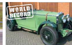
1931 TALBOT 105 FOX & NICHOLL TEAM CAR [OCTOBER, 2009]