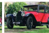
1929 BUGATTI TYPE 44 VANVOOREN SALOON [JULY, 2017]